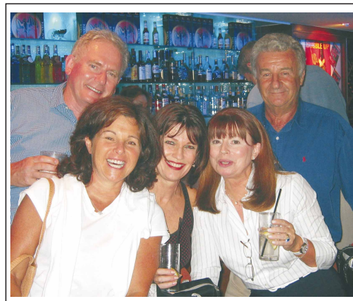
I am at the ANA bar. Nobody looks like leaving.